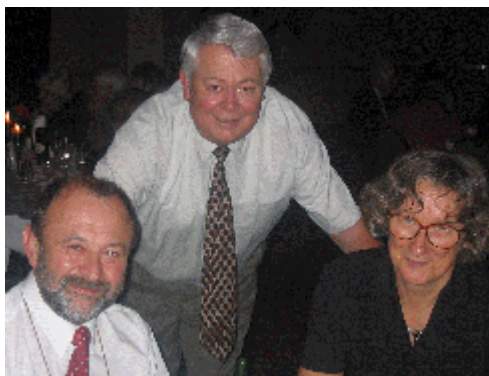
Photograph taken at the ANZCCART Conference Dinner.

The Proceedings of the Conference will be published in due course.