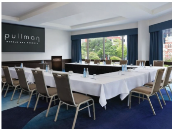
King George Room

There will be a single exhibition area (the King George Room) which will also host delegates during lunch and tea breaks. Plenary presentations will be delivered in the Grand Windsor Ballroom.