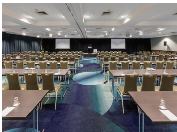
Grand Windsor Ballroom